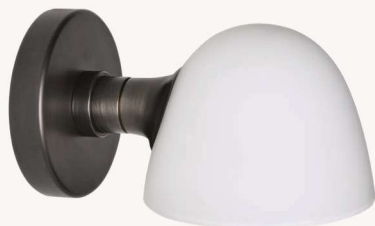
Fuse, Single Wall